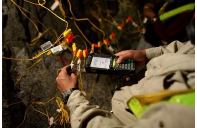
Shotfirer programming the blast. Yellow and red clips indicate the front and rear decks respectively.