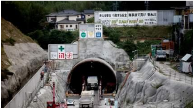
The entrance to the Anei River Tunnel.

Some low lying areas of Toyota City are prone to flooding. The Anei River, which was built in the 1700s, is the existing water course which drains flood water from these areas. However at times of heavy rainfall flooding still occurs.