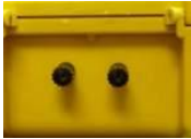
Lead-in-Line ports between hinges and back of box