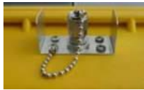
Antenna port of side of box

uni tronic™ 600 Blast Box 310R w/ Easy Modem unit includes: